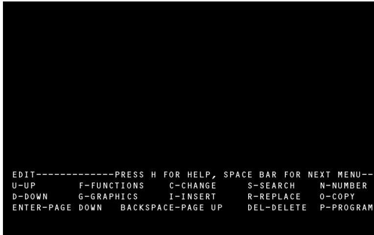
Figure 16-2 Edit Menu

menu functions the same as the PA command editor (see Section 8, PA Command). When the Edit Menu is entered the following screen is displayed.